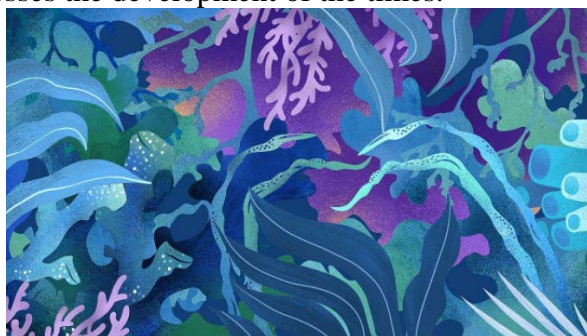
Fig.1 Cultivate Modern Design Concept and Innovative Thinking

First, visual communication design embodies the characteristics of the times and rich connotation. The field of visual communication design is expanding with the progress of science and technology, and it intersects with other fields in the process of expanding. The main ways it presents to the audience are print book design, display image design, etc. it not only conveys information, but also witnesses the development of the times.